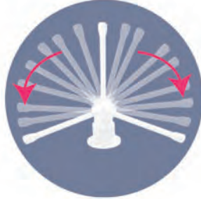
180° spray head